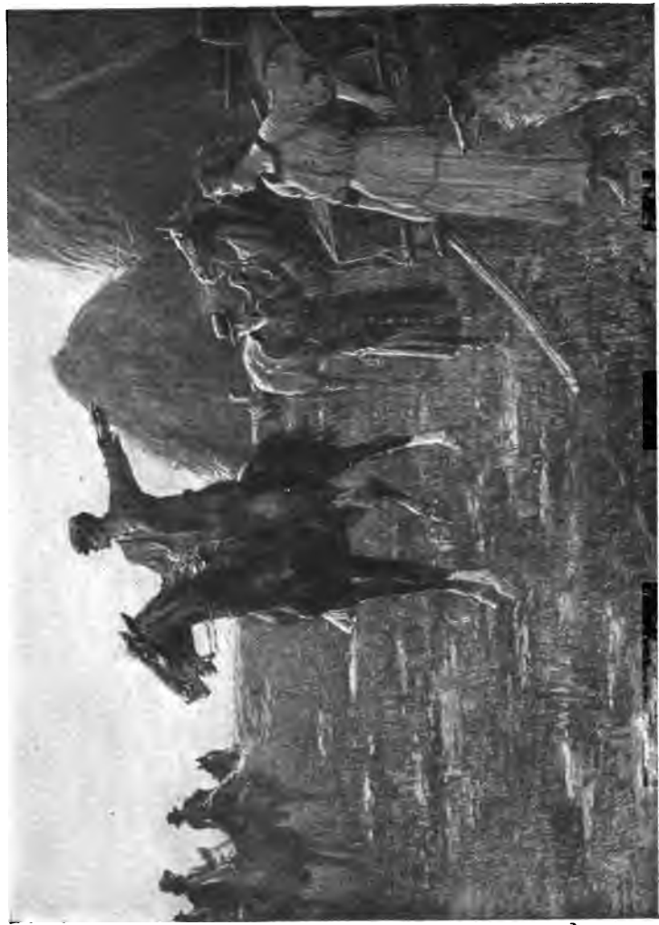
"Swing twenty paces out from one another and circle this shack!"